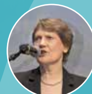
Helen Clark UNDP Administrator

"This is my first time in the Global Landscapes Forum. But I promise that it won't be my last. Yes, we do have to produce more food. Yes, we do have to protect the forests—and support the communities that depend on them. We cannot succeed in one of these challenges without succeeding in the other. But it can be done."